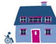
Integrated Neighbourhood Level